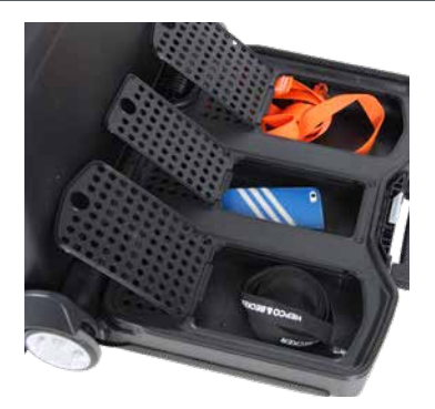
Trolley drive unit with additional compartments.