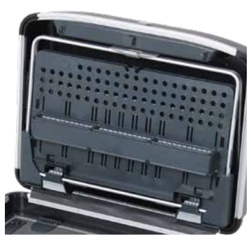
The 2 tool plates have brush holders on the front and textile pockets on the back for tools