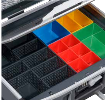
Various sorting options in the ground