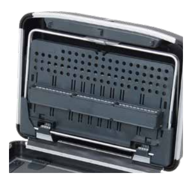
The 2 tool plates have brush holders on the front and textile pockets on the back for tools