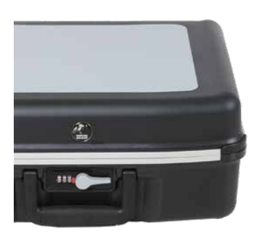
Tight closure with aluminum profile frame One-hand opening, combination lock