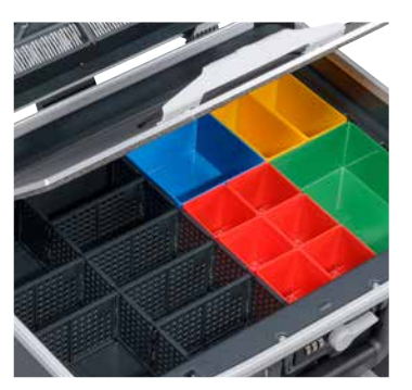
Various sorting options in the ground