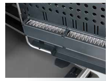
The tool plates have brush holders on the front and textile pockets on the back for tools