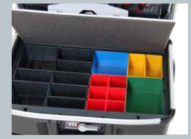
10 matching sorting boxes in 4 different sizes can be exchanged with each other. In the other half freely selectable dividers made of plastic lattices.