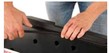
Cover gasket (self-assembly) attached