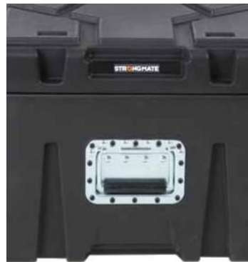
High-quality folding handles