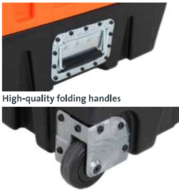
High-quality folding handles