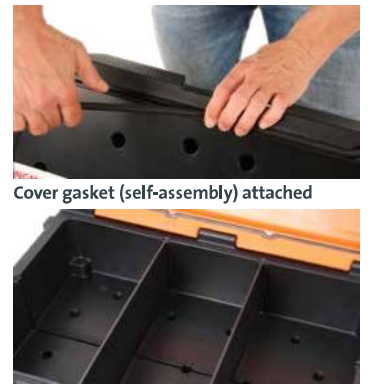
Cover gasket (self-assembly) attached