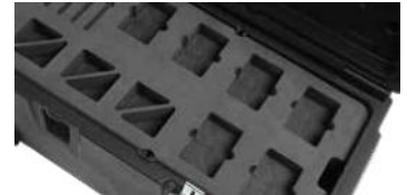
On demand: Equipment with foam