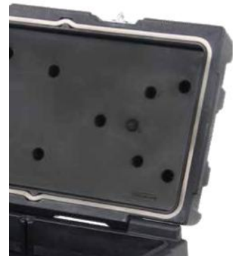
Cover gasket (self-assembly) attached