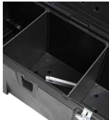
On demand: Equipment with partition system 8 holes for mounting kit inside