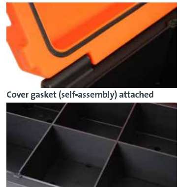
Cover gasket (self-assembly) attached