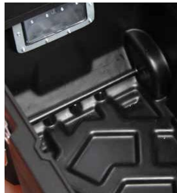
Single-walled HDPE stacking transport box