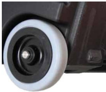
High quality rubber rollers Plastic cams as abrasion protection at stair use