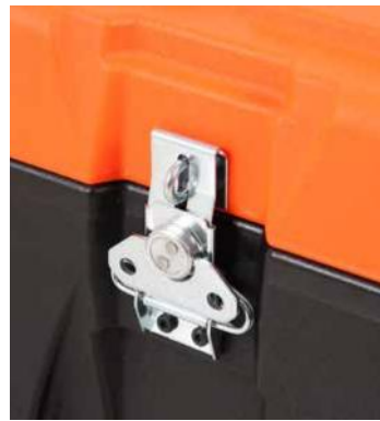
High-quality butterfly locks Possibility for lock attachment