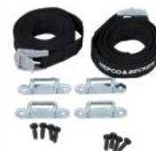
Equipment: Fastening kit inside, consisting of 2 straps, 4 fastening hooks and screws