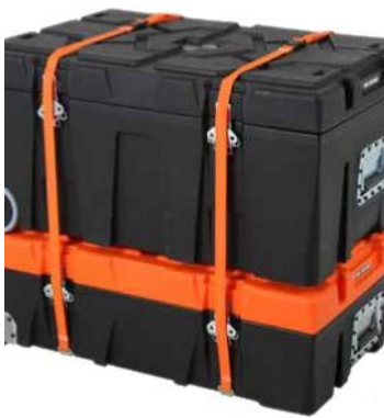
Stackable Fastening set as accessory