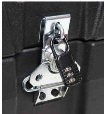
High-quality butterfly locks Possibility for lock attachment