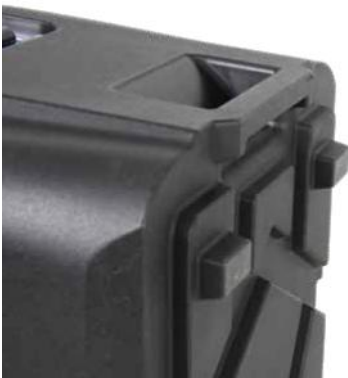
Integrated handle Cams as adjusting feet and for locking during stacking