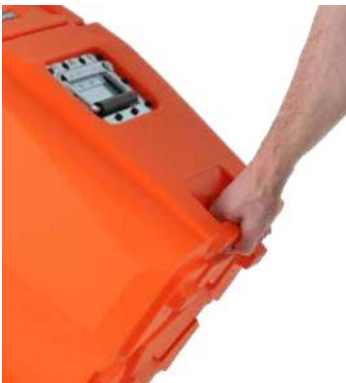
Integrated handle High-quality butterfly locks and folding handles