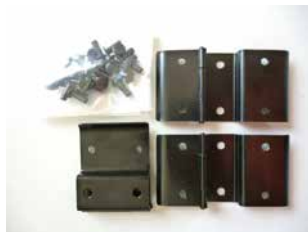
Hinge 90 4000 0014 1 set