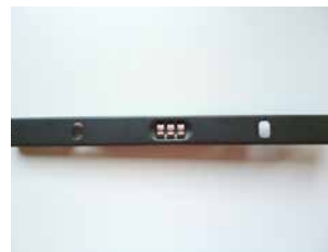
Handle rail with Combination lock 90 4000 0010 1 piece