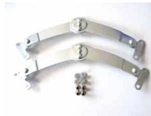
Lid holder 90 4000 0011 1 set