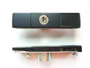
Lock 90 4000 0009 1 piece