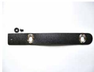
Flap big 90 4000 0048 1 piece