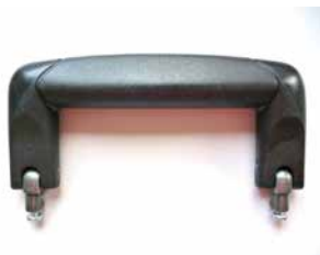
Handle 90 4000 0008 1 piece